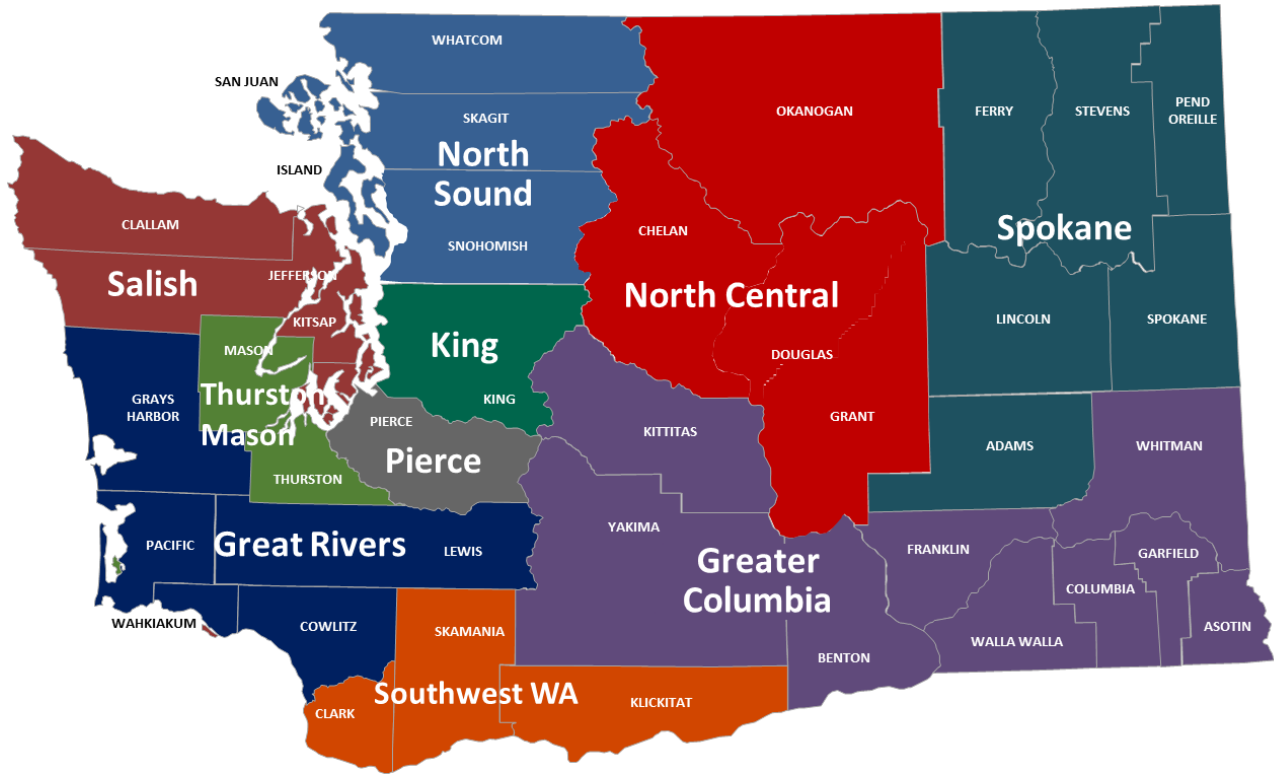
Map of regional FYSPRT boundaries